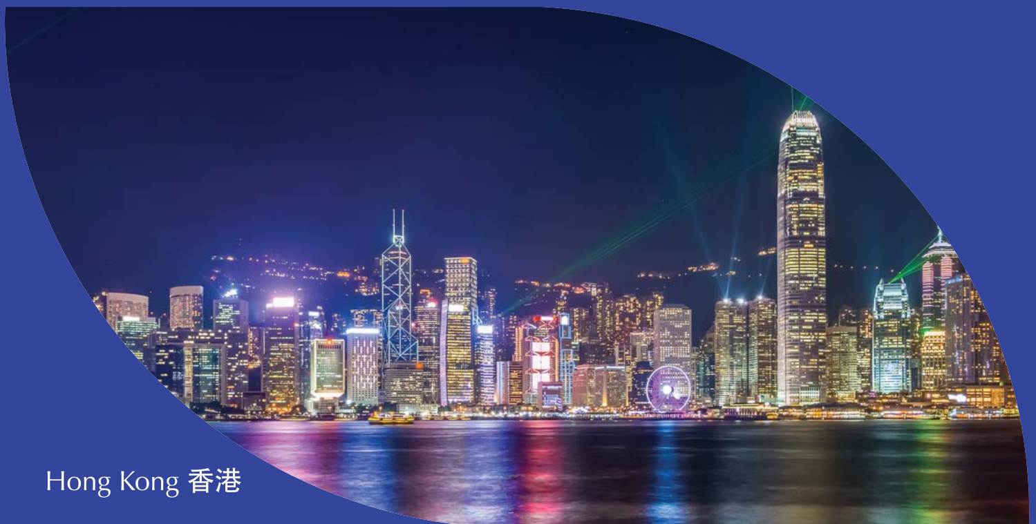
Hong Kong 香港

Stevenson, Wong & Co. is well positioned to serve you in the Greater Bay Area. We established our Guangzhou office as early as 2002. Through its association with AllBright Law Offices, one of the largest firms in Mainland China with over twenty branches throughout the region including Shenzhen and Guangzhou, we are in an unmatched position to assist, advise and advocate in this region. In addition, as a founding member of INTERLAW, an international organisation of over 7000 lawyers in more than 150 cities, we offer an international network of legal service of excellence, unmatched by any other.