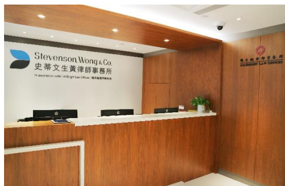
39 th Floor, Gloucester Tower, The Landmark

Over the last 40 years, our business has changed significantly through expansion, relocation and new partnerships and our international network has supported clients around the globe, helping to bridge China and the world.